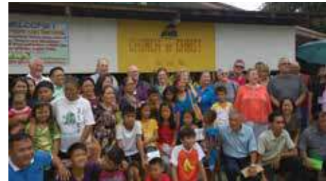
MOSES at work in the Philippines