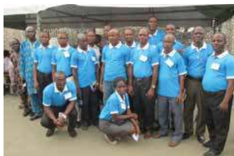
Volunteer workers on WBS Team Lagos

Once again, I had the privilege of taking part in the Great Workshop, as well as working in other places. We worked in Greater Lagos with our WBS Team Lagos, visiting schools and new church plants in that vast urban area. We also traveled to Uyo State and joined another great WBS Team with a new church plant where we enrolled over a 1,000 new students. Over 22 WBS teams have formed in different regions where the Christians have taken it on themselves to work together to do a better job of evangelizing their location. This is leading to many church plants and hundreds being brought to Christ each year. We commend our Nigerian brethren for their willingness to work together to reach a lost world.