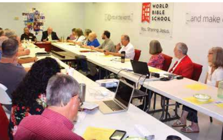
WBS personnel work on 2017 plans.

While the Strategic Plan covers five years (2017–2021), it undergoes regular review for changing conditions. But in every case, after the priority of honoring God, a leading concern is needy people . As a recent President's Report states, "WBS'